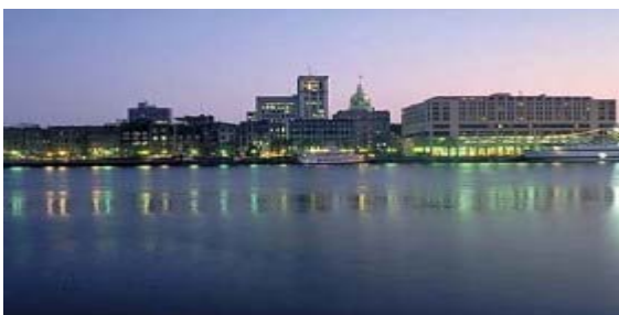
The picture to the left is the Historic River Street in Savannah, Georgia